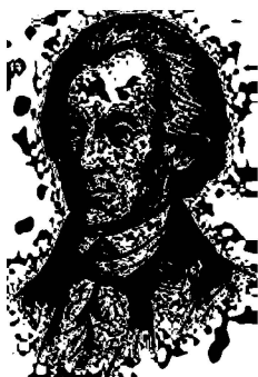
Richard Henry Lee

RICHARD HENRY LEE was born in Stratford, Virginia, January 20, 1732; died at Chantilly, Virginia, June 19, 1794. He was the son of Thomas and Hannah (Ludwell) Lee. He was educated in England, and on his return to the colony applied himself with diligence to the study of law. In 1761 he was